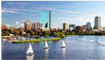
Boston, MA, USA