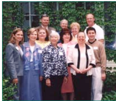
The 2005-2007 IAFSA Executive Board.